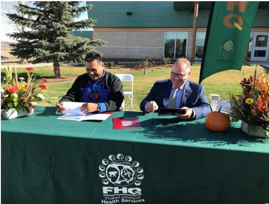
October 18 Signing Ceremony for MOU with All Nations Healing Hospital