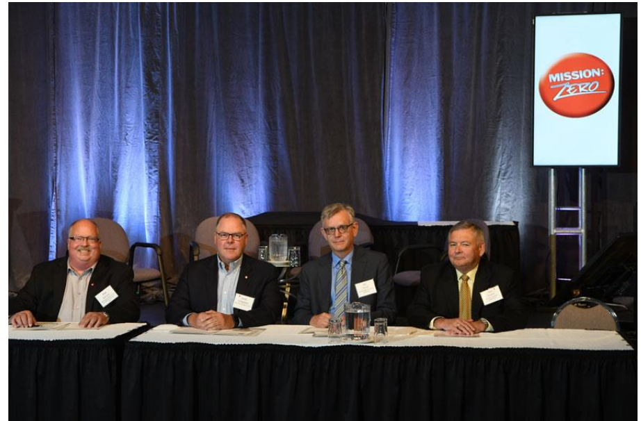
June 13 signing ceremony: Sask. Health & Safety Leadership Charter