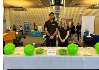
University of Windsor Nursing Career Fair November 26 Windsor, ON