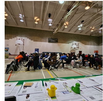
Cote First Nations Career Fair December 6 Kamsack, SK