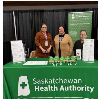
PAGC Urban Creating Connections Job Fair November 29 Prince Albert, SK