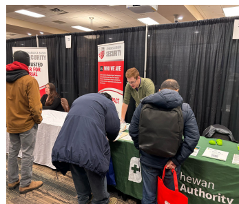
WORKNOW! Career Fair March 4 Saskatoon, SK