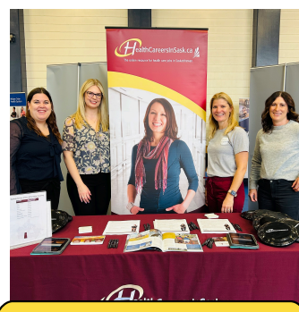
Michener Career Fair March 12 Toronto, ON