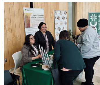
Indigenous Student Career Fair March 12 Saskatoon, SK