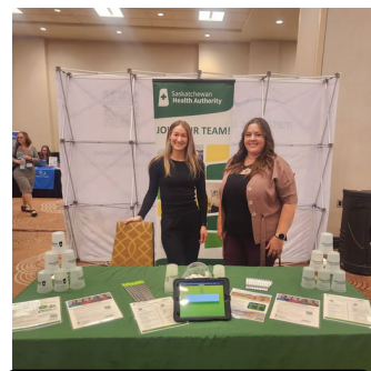
Nurse Practitioner Association of Canada Annual National Conference April 11 Toronto, ON