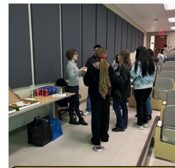
U of S 4th year Nursing Students Employer Recruitment Event April 7 Saskatoon, SK