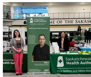
Sakāskohc High School April 3 Onion Lake, SK