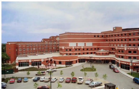
Regina General Hospital main entrance.